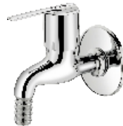
Cat. No. : ST-320 Nozzle Bib Cock