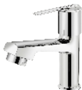
Cat. No. : ST-302 Pillar Cock