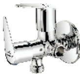
Cat. No. : ST-219 2 way Angle Cock