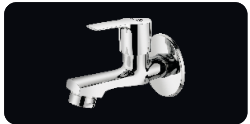
Nexus Collection 12-13