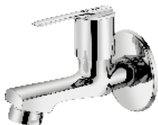
Cat. No. : ST-301 Bib Cock With Wall Flange