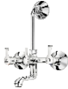
Cat. No. : ST-110 Wall Mixer With Bend For Arrangement Of Overhead Shower