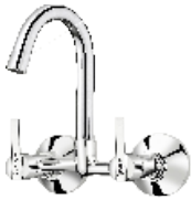
Cat. No. : ST-309 Sink Mixer With Regular Swinging Spout (Wall Mounted)