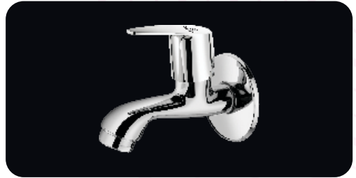
Opera Collection 08-09