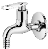
Cat. No. : ST-520 Nozzle Bib Cock