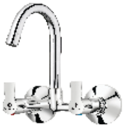
Cat. No. : ST-409 Sink Mixer With Regular Swinging Spout (Wall Mounted)