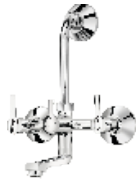
Cat. No. : ST-310 Wall Mixer With Bend For Arrangement Of Overhead Shower