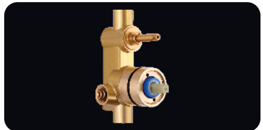
Spout & Allied Collection 16-17