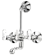
Cat. No. : ST-510 Wall Mixer With Bend For Arrangement Of Overhead Shower