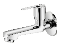
Cat. No. : ST-304 Bib Cock Long Body With Wall Flange