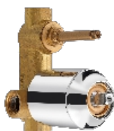
Cat. No. : ST-1005 Hi Flow Single Lever Concealed Diverter Body + Cartridge + glassy (45mm Cartridge)