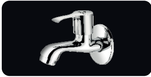
Rubic Collection 06-07