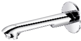
Cat. No. : ST-01 Bath Tub Spout With Wall Flange