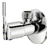
Cat. No. : ST-303 Angular Stop Cock With Flange