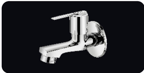
Bliss Collection 10-11