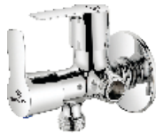
Cat. No. : ST-419 2 Way Angle Cock