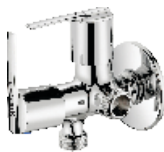
Cat. No. : ST-319 2 way Angle Cock