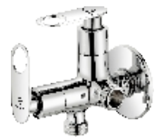
Cat. No. : ST-519 2 Way Angle Cock