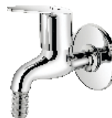
Cat. No. : ST-220 Nozzle Bib Cock