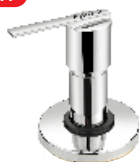
Cat. No. : ST-306-P Exposed Part For Concealed Stop Cock With Wall Flange (compatible - St-1001)