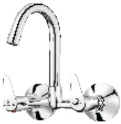
Cat. No. : ST-209 Sink Mixer With Regular Swinging Spout (Wall Mounted)