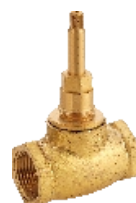
Cat. No. : ST-1003 Flush Cock With Washer System Body (h/t) - Heavy