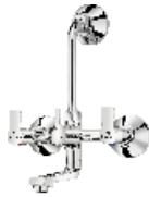
Cat. No. : ST-410 Wall Mixer With Bend For Arrangement Of Overhead Shower