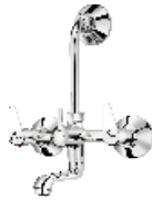
Cat. No. : ST-210 Wall Mixer With Bend For Arrangement Of Overhead Shower