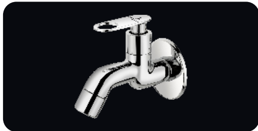
Orion Collection 14-15