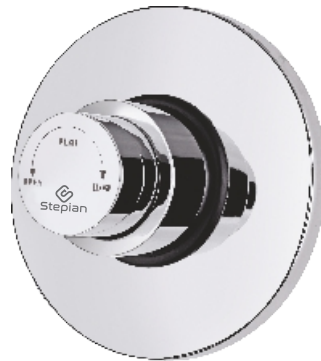
Cat. No. : ST-12 Metropole Flush Valve (Concealed Body) With Control Cock (40mm) Operation Plate (Round) 1.5"