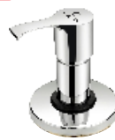
Cat.No. : ST-112-P Exposed Part For Flush Cock With Wall Flange (compatible - St-1002/st-1003)