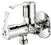
Cat. No. : ST-119 2 way Angle Cock