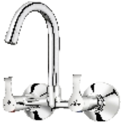
Cat. No. : ST-109 Sink Mixer With Regular Swinging Spout (Wall Mounted)