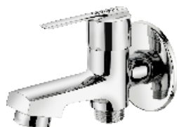
Cat. No. : ST-305 2 in 1 Bib Cock With Wall Flange